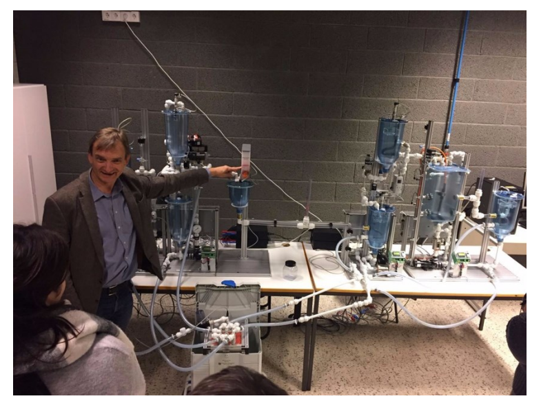
Illustration 9: programmable water cycle model

The most inspiring system was the experiment that simulated a wave or the experiment which simulates a sewage treatment plant.