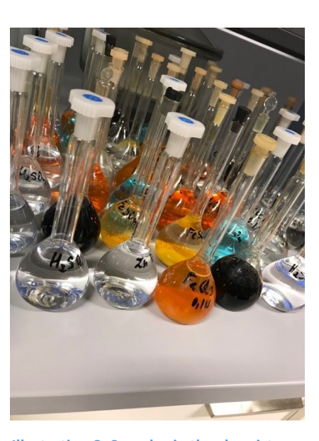
Illustration 8: Samples in the chemistry lab

computer-controlled milling machines and another room students can work on their own projects f.e. building and programming combat vacuum cleaner robots. We saw students working until nine o'clock in the evening. Later we saw the chemistry lab, the Latvian professor said that they are producing their cocaine, check the quality and burn it here. That was a good joke.