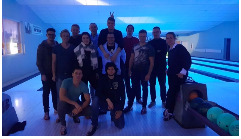
Illustration 12: German and Latvian students in the bowling center in Rezekne

their rooms and houses with wood. Everywhere the chimneys smelled.