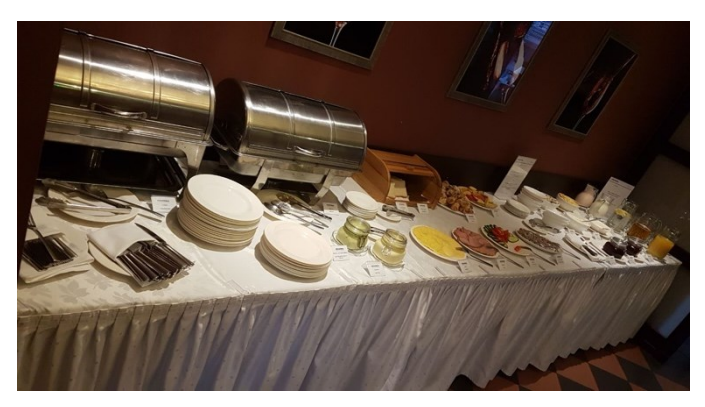
Illustration 4: Breakfast at Kolonna Hotel in Rezekne

As the Rezekne Technology Academy (RTA) is in walking distance we started early enough our approximately 20-minutes foot walk.