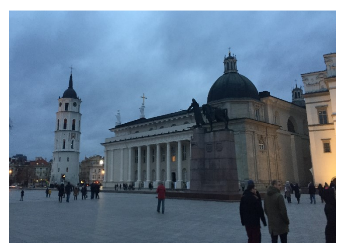
Illustration 22: Cathedral in Vilnius, the capital of Lithuania

On Saturday the 18<sup>th</sup> of November we woke up at 7:30 am. The weather was cloudy and cold. We were picked up from Rezekne at 9 o'clock by bus and drove to Vilnius. Some of us didn't had breakfast, because we had a little party with students from Rezekne the night before. The trip back to Vilnius was smoother than the ride from Vilnius to Rezekne 6 days before, probably because most of us were sleeping. We arrived in Vilnius at 1 pm. The weather in Vilnius was also cloudy and cold.