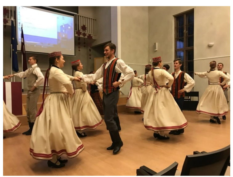
Illustration 17: traditional folk dance in auditorium

We watched the production steps while a skilled worker guided us from station to station. The tree trunks were put into hot water and afterwards peeled into wooden sheets. These wet sheets were dried first and then split into quality classes. The wooden sheets are layered