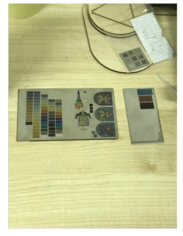
Illustration 11: colors which can be produced with the laser

After that campus tour, we decided to go bowling with a few Latvians. On our way to the