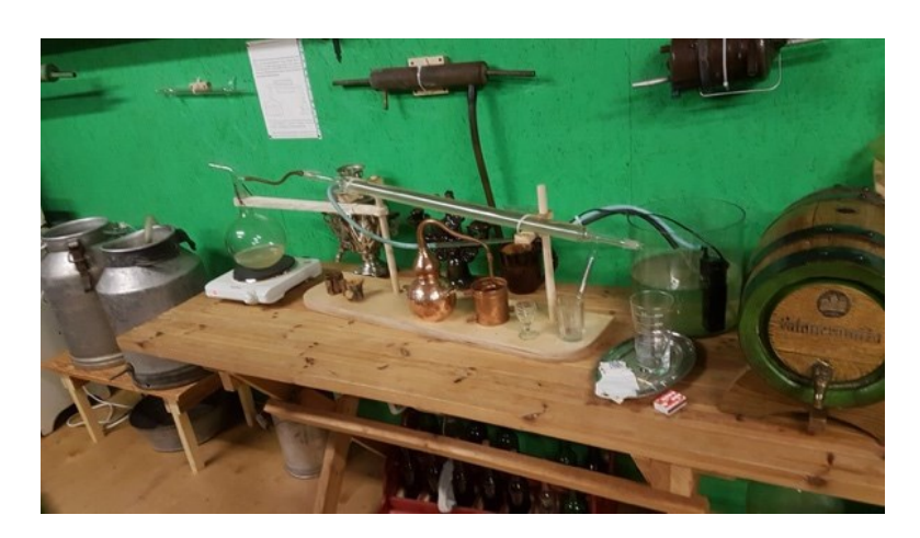
Illustration 21: Old brewery

traditional music instruments. Each of us got the opportunity to try out the different instruments and even play together. It was a very interesting experience and we had a lot of fun there.