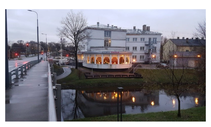
Illustration 3: Hotel "Kolonna" in Rezekne