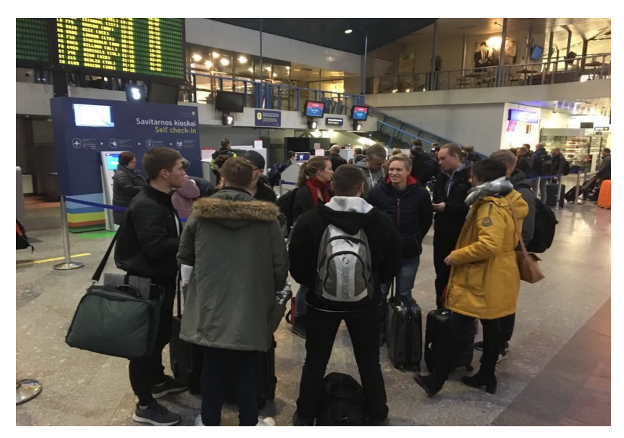
Illustration 24: Students before departure in Vilnius

Because we still had a little time to fly, we visited the shops at the airport. Then we slowly got on the plane to fly back home. After the almost two-hour flight, we landed safely in Bremen, picked up our luggage and drove home.