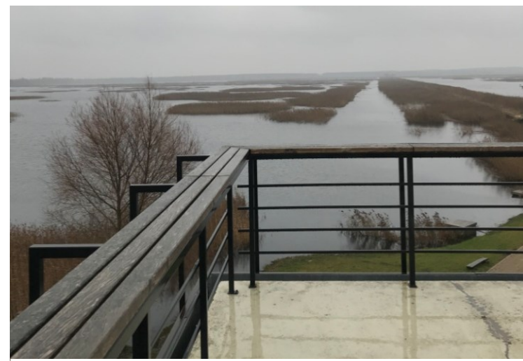
Illustration 16: Lake Lubana

That Thursday morning, some of the German students choosed to sleep some more minutes than having breakfast. So comparison to the days before we went continuously separated to the Rezekne Academy Technologies. While some of the students German tried accelerate their morning routine, the other students were already setting their final implementations in the program. After a while most of the groups started to prepare the presentations.