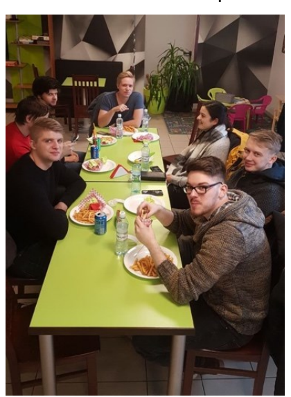
Illustration 5: Lunch at Jam Burger

We tried to program the first tasks that were given to us. Some groups had to solve before some substantial problems they had with their hardware equipment. For example, one group needed to fix their hydraulic system of the setup first. This group had the most difficult setup in my opinion because it wasn't just a software issue, they also needed to connect wires to solve the hardware problems. A very complex but modular automation system was