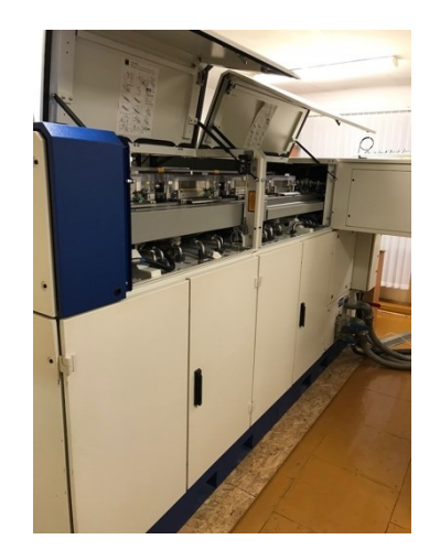
Illustration 10: Laser system in the laser center of RTA

After that went to the laser center which is located in another building. Some lasers are also from Germany. A Latvian student roughly explained how the different lasers work and for which different materials the lasers are applied. He also told us that the laser from China was broken when it was delivered. But they did not