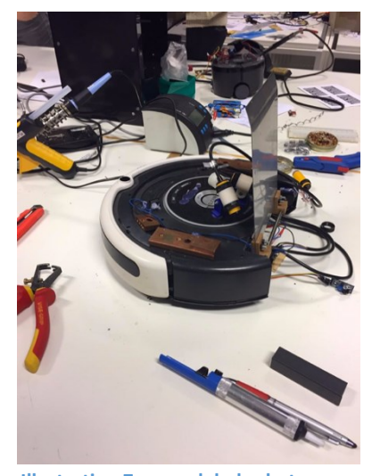
Illustration 7: remodeled robot vacuum cleaner

For lunch we visited the canteen. It is a room that is not even as big as a lecture room in our university. It is relatively dark, but nicely decorated.