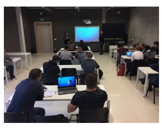
Illustration 20: Graduation presentations in college

At 10 am each group started to present their project and answered some questions. After the theoretical presentation we went into the laboratory to show the result of our work practically. At the end, we received a certificate about our project.